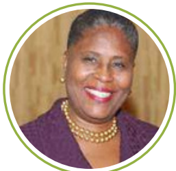
Judge Ernestine Gray (Ret.)